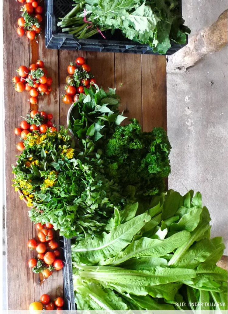
UNDER TALLARNA är ett odlingskooperativ som arrenderar kommunal mark.

Här produceras livsmedel på ett hållbart sätt.