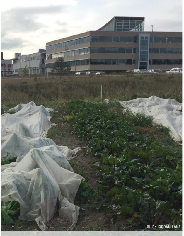
EKOODLARNA I TELGE är ett Socialt Företag där grönsaker odlas ekologiskt.

Grundidén med Ekoodlarna i Telge är att odla ekologiskt på mark som annars inte utnyttjas och arbetskraften ska bestå av människor som har svårt att komma in på arbetsmarknaden.